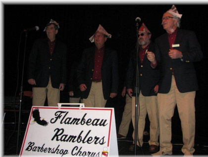
Flambeau Barber Shop Chorus

In the past news letter I mentioned that 98Q Country was going to be featuring a 98Q Country Christmas Concert to help fill our community lord's food cupboard so there was enough food to help families during the Christmas Holiday. On December 12 the concert brought in almost 300 people and quite a bit of food plus 1500 in cash as well. It was a great evening of entertainment by one of our hot local country bands called "Yankee Train". Also featured entertainment was the Flambeau Ramblers Barber Shop Chorus.