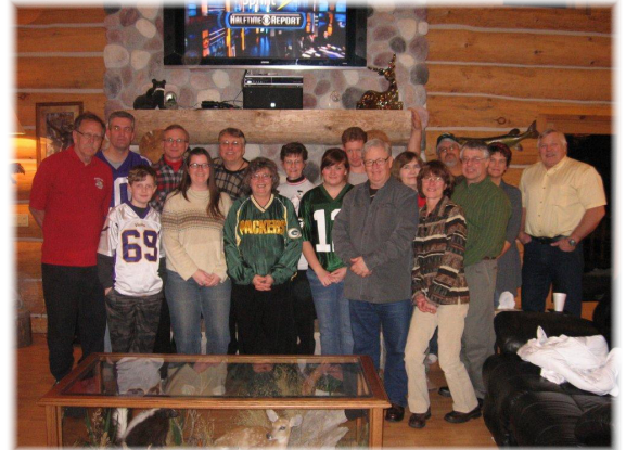
Park Falls Christmas Party