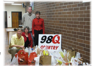
Christmas Food Drive