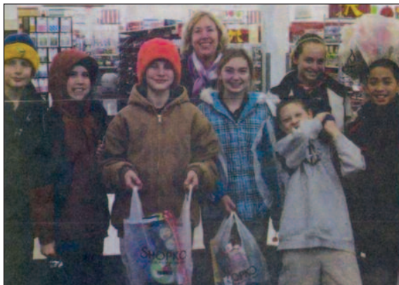
"CANDYGRAMS" to help the needy, was a program the Saint Anthony's School Student Council group headed up to help buy Christmas gifts for our area needy children.