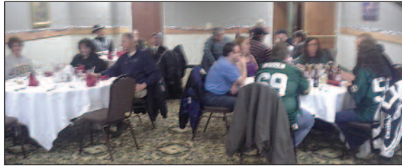
Ashland staff at the party.