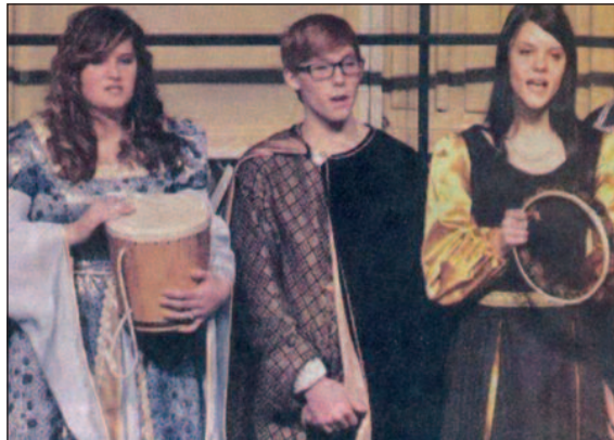
Chequamegon Madrigal singers sing a cappella as one of the many acts that performed on stage during the High School Christmas Concert.