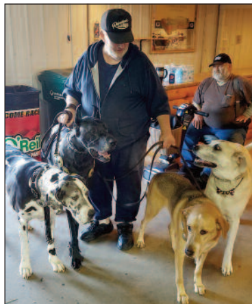
The 3rd annual Pet Expo was held Saturday, Oct. 22nd and drew crowds of pet-lovers and a variety of 4-legged critters.