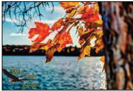
A view of the lake at Wild Eagle Lodge, Blue Heron Restaurant.

Roberts, a long-time resident of the Northwoods, consults many clients on in-