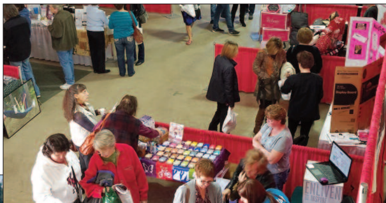
The 3rd annual Women’s Expo was another success with more than 500 in attendance and over 40 exhibitors.